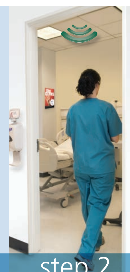
Entry into the patient room is captured as a hand hygiene "opportunity" and transmitted.